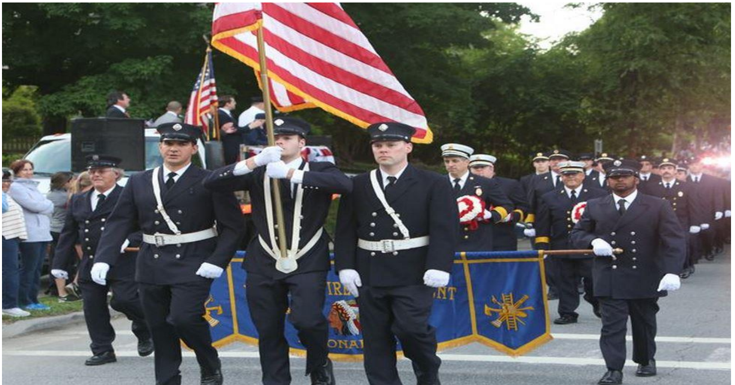
The Annual Katonah Fire Department Parade, which kicks off our annual carnival.