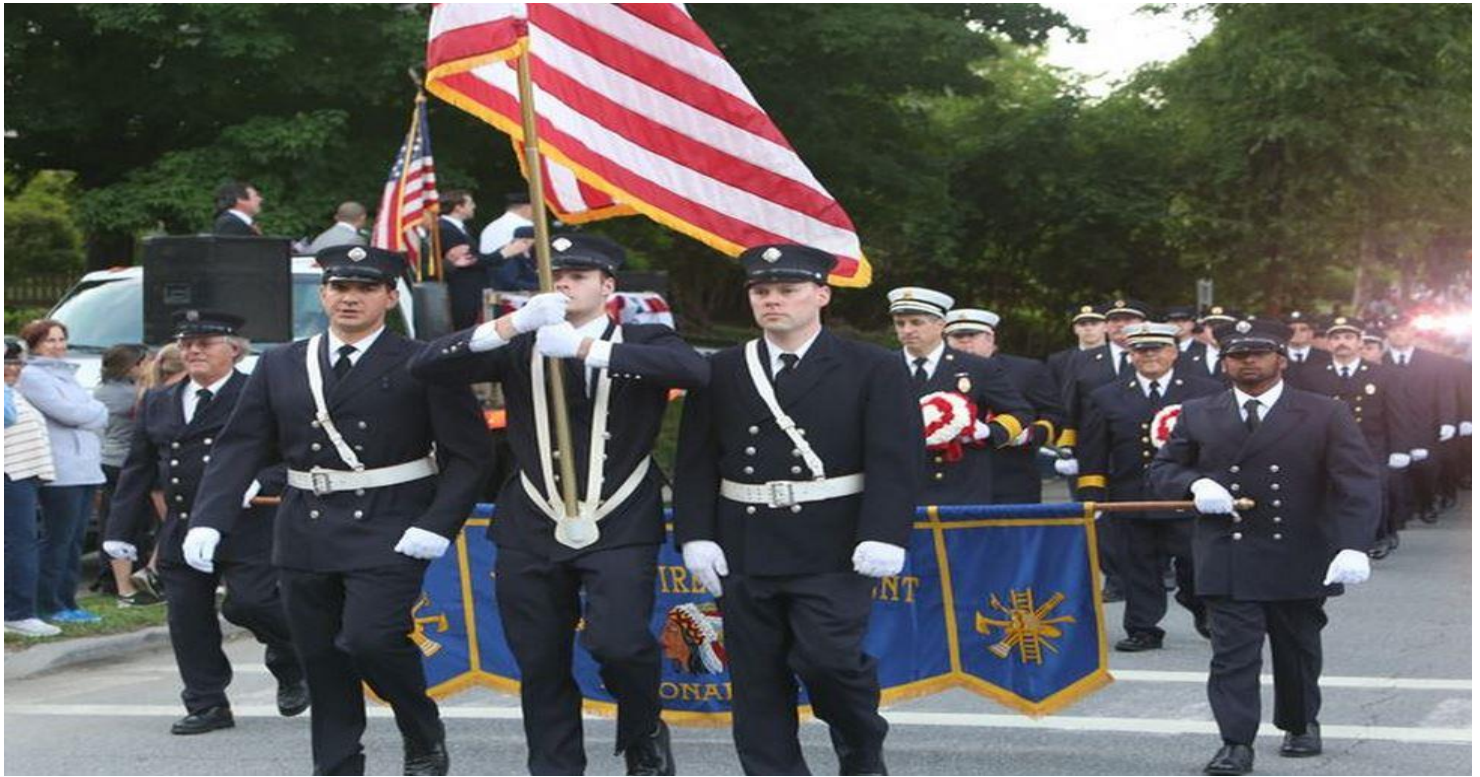
The Annual Katonah Fire Department Parade, which kicks off our annual carnival.