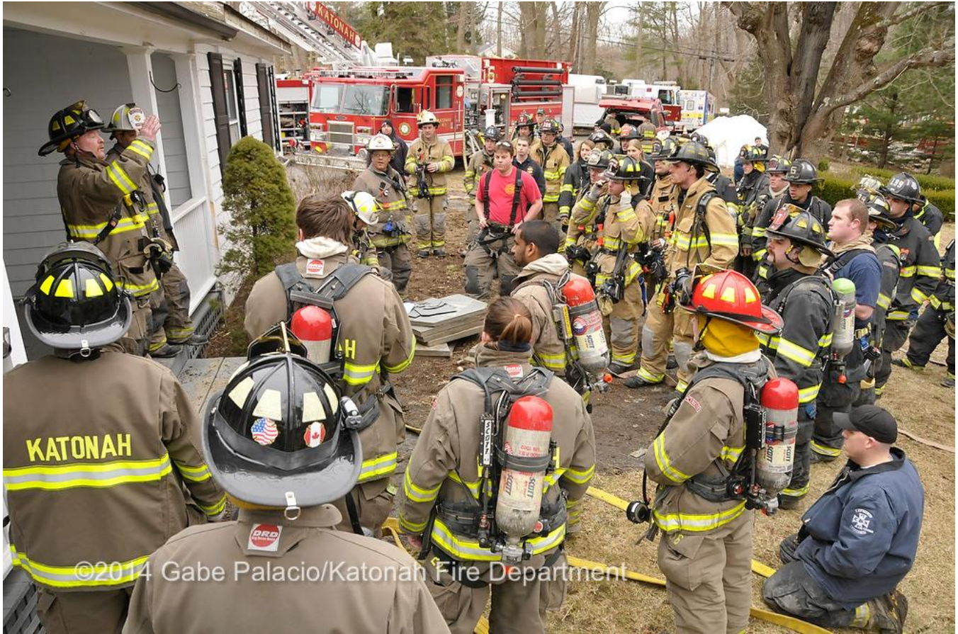
Katonah, Bedford Village, Bedford Hills, Golden's Bridge and Mt. Kisco fire departments preparing for a joint "Live Burn" training exercise.