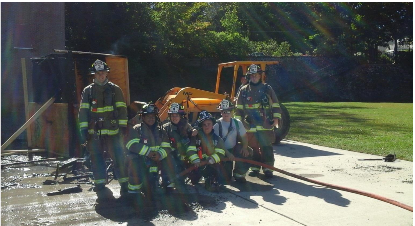
KFD members pose for a photo following a live burn demonstration at our annual Open House.