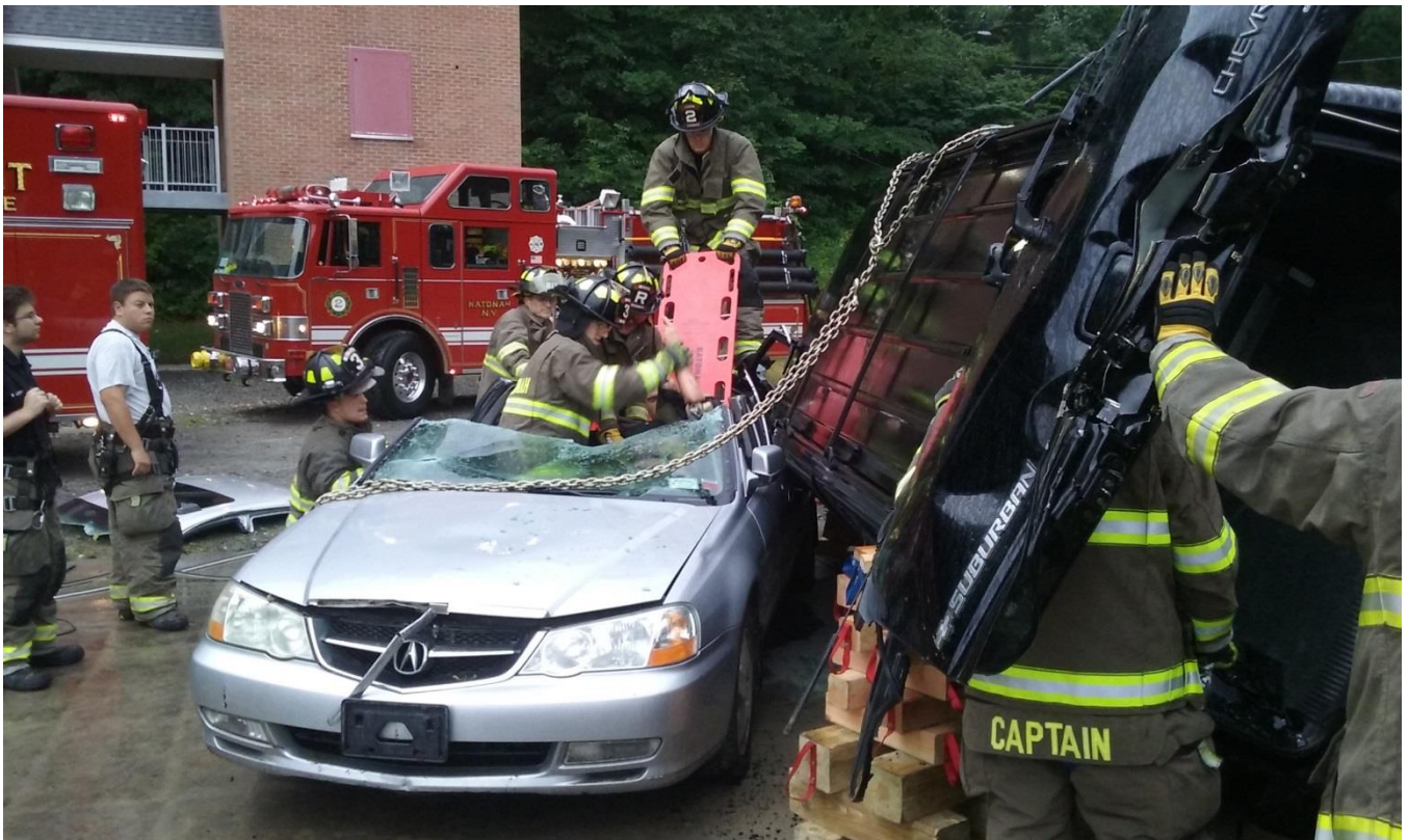
katonah Fire Departing members performing a motor vehicle accident rescue drill.