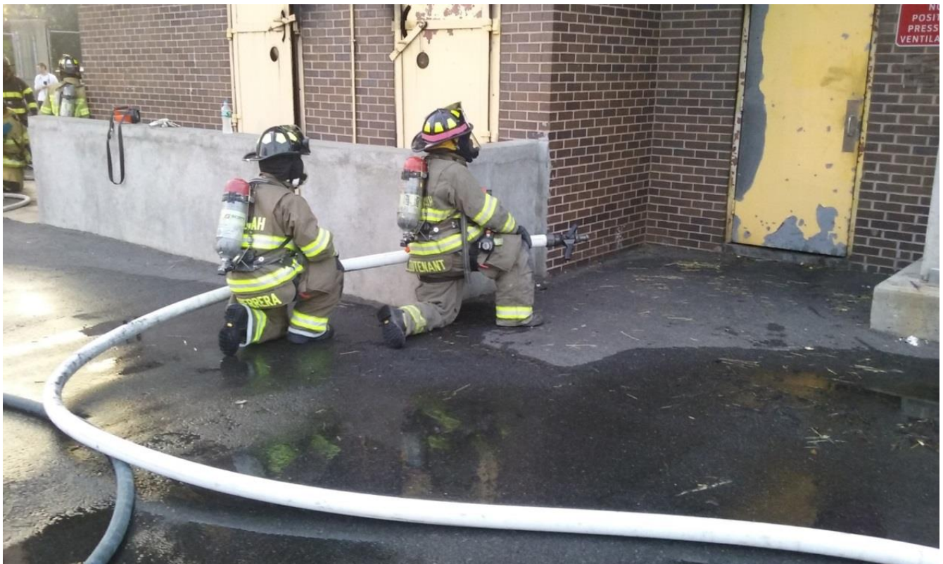
Katonah Fire Department members train on Fire Attack at the Westchester County Training Center in Valhalla.